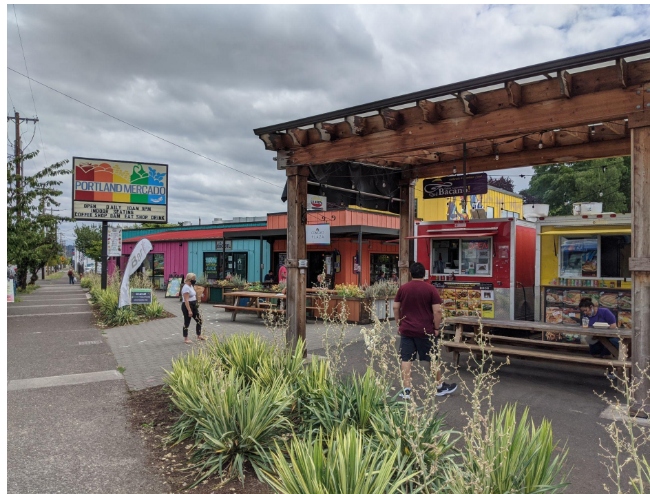
Portland Mercado - Portland, OR