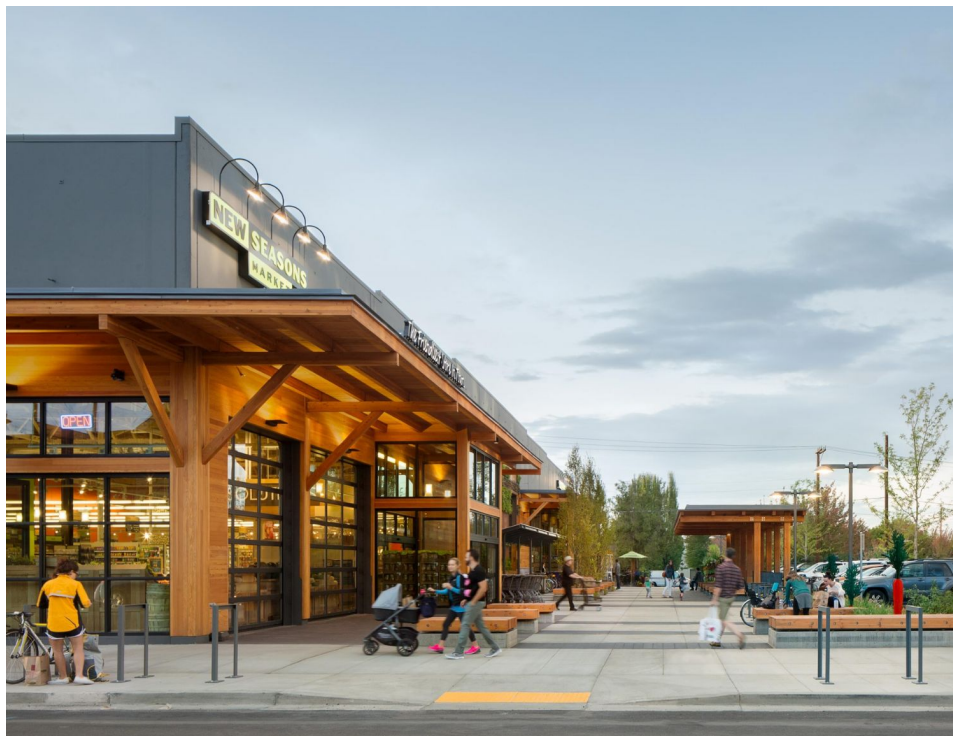
New Seasons - Portland, OR

On the southern parcels, which currently contain Airrow Heating, Columbia Distributing, and Hoover's Pub and Grill, a small retail cluster and single large stand-alone restaurant (new or refresh). The southern parcels are privately-owned and concepts will be influenced by ongoing conversations with the current business and property owners. The site should leverage adjacency to the Ferry Slip gateway site.