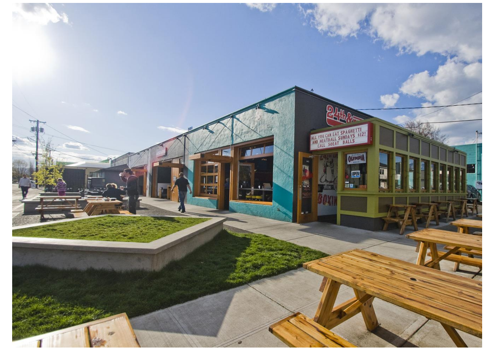
The Ocean - Portland, OR