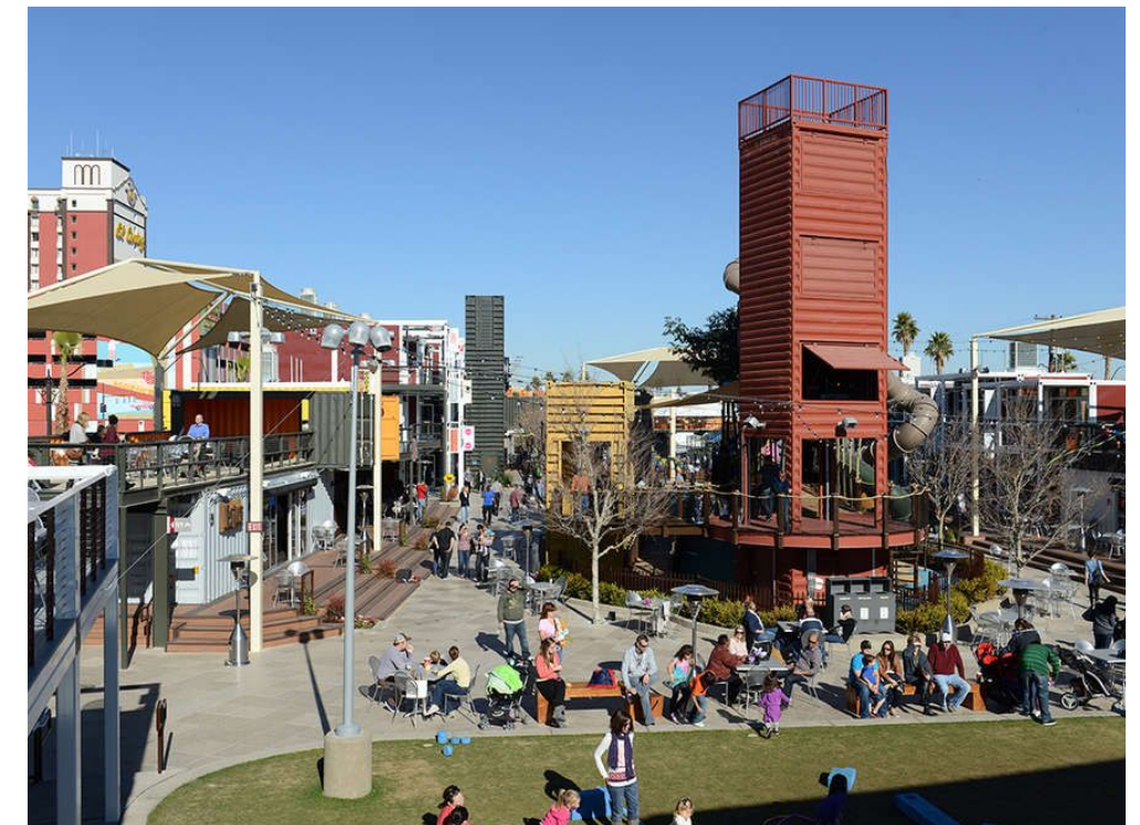
Las Vegas, NV